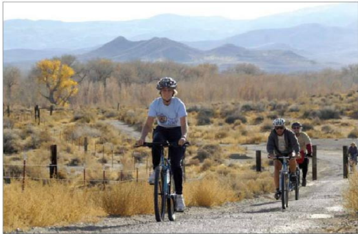
The new four-mile section of the Tahoe-Pyramid Bikeway near Wadsworth

Since the Pyramid Lake Tribe is not in the casino business, their goal is to foster other kinds of economic activity, including low-impact tourism. The Bikeway fits this tribal goal perfectly, making it a welcome proposal.